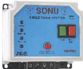
Model: SS 22