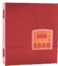
Model: KDP 99 (MS)