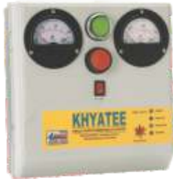
Model: KSD 22