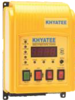
Model: KTC 22 WLC