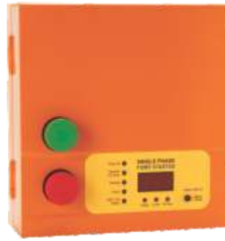
Model: KDP 22 (MS)