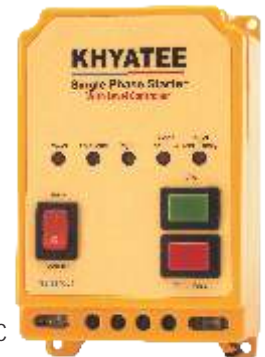
Model: SS 22 WLC