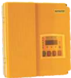
Model: KDP 99