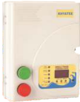
Model: KDP 22