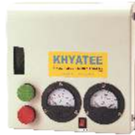
Model: KSR 22