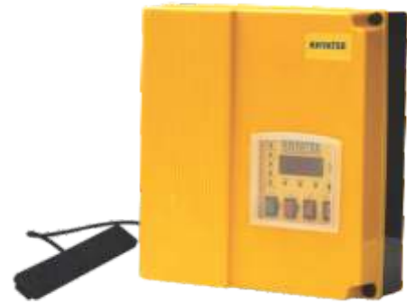
Model: M1 KDP 99 GSM CONNECTION DIAGRAM